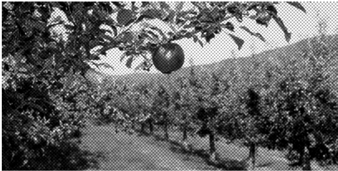
Last fall, the first apples grown in Samazar brought joy to thousands of residents during the first Apple Festival ever held in the Diamond City.