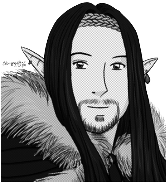
Alair Syldithas is the founder and Editor-in-Chief of The Diamond City Times. Contact him by courier, or leave a message for him at the Sky Chapterhouse of the Adventurers Guild.

Those interested in aiding the Kaewonese resistance are encouraged to leave a message with the Times.