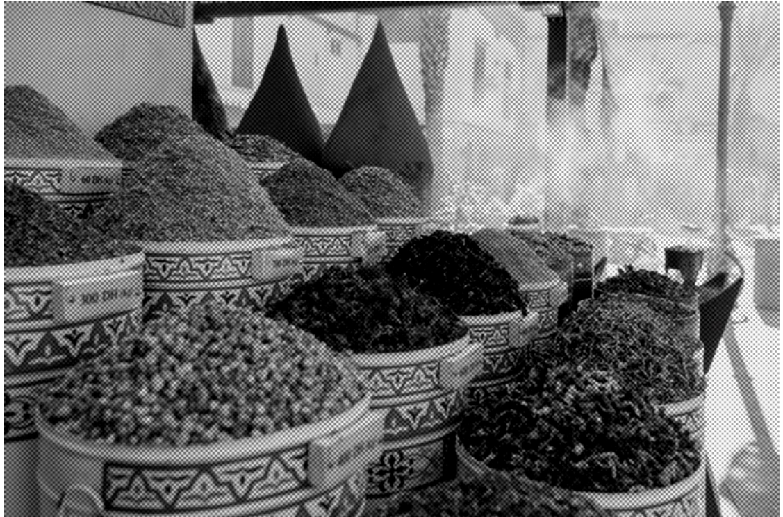
Visit the Spice Bazaar for foods locally grown in the Green District or imported from all around the world.

Welcome to Samazar, city of magic and invention!